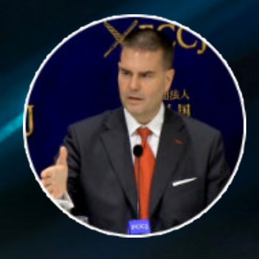
GLEN WOOD SMART VISION LOGISTICS